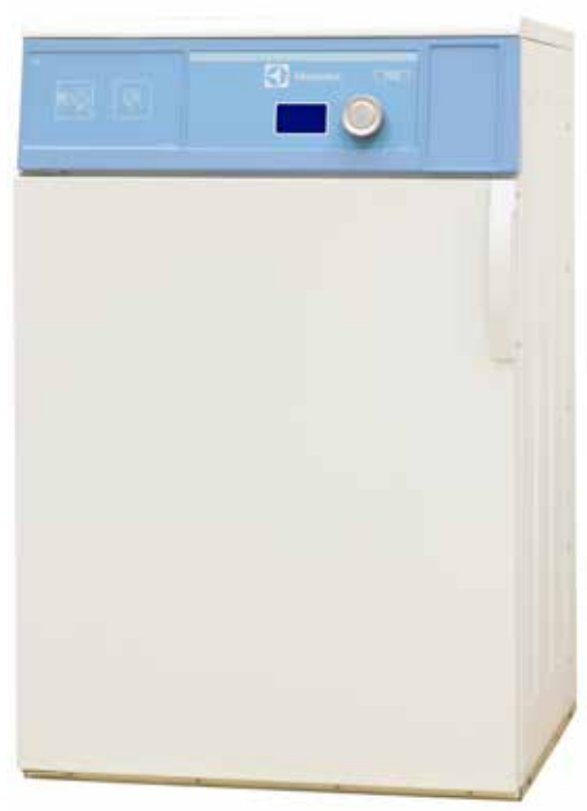
Images shown are a representation of the product only and variations may occur.